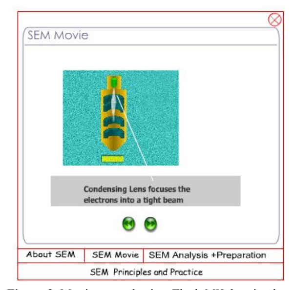
Figure 2. Movie created using Flash MX showing how the Scanning Electron Microscope works

The package is presented and subdivided into ten subsections: For the purpose of this paper examples of the sub-sections have been displayed independently of the user-template to conserve space (Figures 2 - 4). Researchers will log-on to the system and can work collaboratively with their peers through the use of the discussion forum. Hypotheses can be constructed and challenged, references can be shared, and they can discuss their approach and evaluate it against the work of others. Researchers can be encouraged to self-assess through the use of the online quiz after exploring the techniques and analysis sub-section. Feedback to question gives encouragement when a response is correct and an explanation when the response is incorrect.