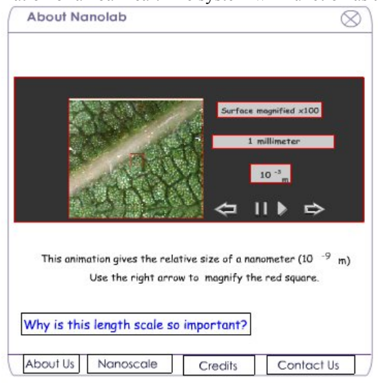
Figure 3. Interactive animation of an oak leaf demonstrating Nanoscale range

Figure 2 illustrates a movie created using Flash MX about how the Scanning Electron Microscope works and Figure 3 demonstrates the Nanoscale range using an interactive animation of an oak leaf. The system will function as a