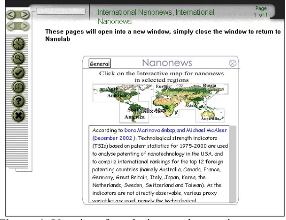
Figure 1. User interface design used to navigate around Nanolab

in aiding fellow researchers. For the purpose of contacting supervisors, email should prove an adequate means of communication.