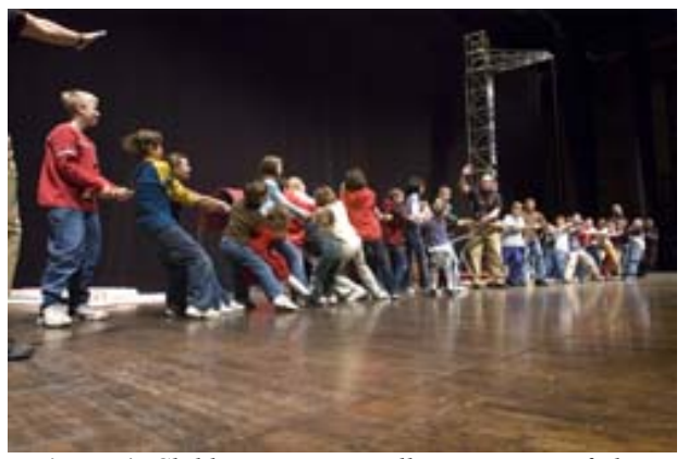
Figure 4. Children trying to pull apart a pair of plates held together by a vacuum seal

a vacuum seal. In another demonstration, the "poop organ," the physicists roll out several lengths of sewer pipe and play "Twinkle, Twinkle, Little Star." Fortunately, it's the kids and not the physicists who supply the vocal accompaniment to this one.