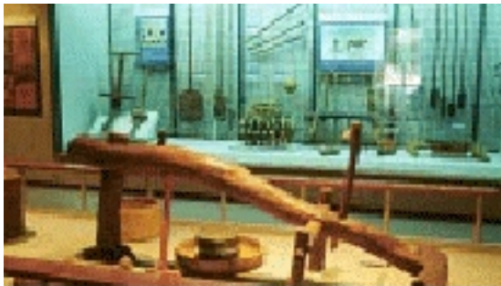
Figure 4. A treadmill demonstrates the physics of levers directly