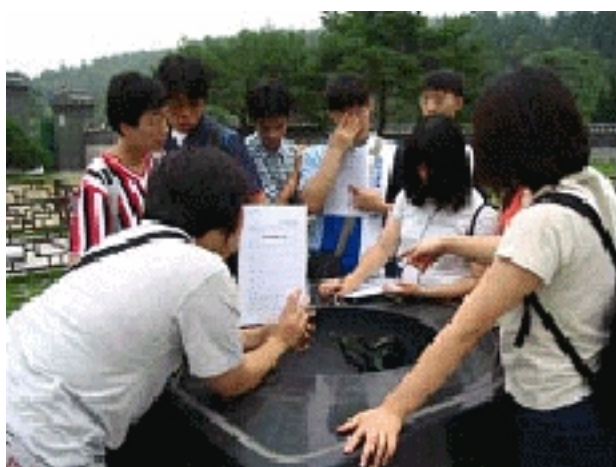
Figure 1. High school students discuss sundials at King Sejong's tomb

Scientific explorations at cultural sites, such as the old palace, the world cup stadium, the world cultural heritage, and museums have been developed and researched actively from the year of 1998, when the first APEC Youth Science Festival was held. At that time, scientific exploration programs at Changdukgyung palace, Celadon village, a Korean folk village and the old printing museum were developed and evaluated as unique programs during the first APEC Youth Science Festival.