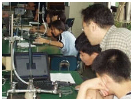
Figure 6. Middle school students doing experiments using MBL equipment

The Korean government and other opinion leaders are expressing concerns about the fall-off in science and engineering major students since 2001. Physicists especially are worried about the radical fall-off in physics major students. One way to boost the number of science and engineering major students is to improve school science education and modernize the school science and physics laboratories. MBL is one of the keywords and many pre-service and in-service teacher training courses are adapted MBL experiments. Especially, sound related experiments are getting popular with MBL.