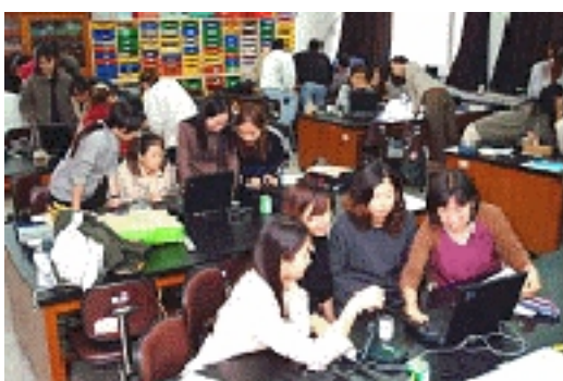
Figure 5. MBL at Chuncheon National University of Education

The Korean government and other opinion leaders are expressing concerns about the fall-off in science and engineering major students since 2001. Physicists especially are worried about the radical fall-off in physics major students. One way to boost the number of science and engineering major students is to improve school science education and modernize the school science and physics laboratories. MBL is one of the keywords and many pre-service and in-service teacher training courses are adapted MBL experiments. Especially, sound related experiments are getting popular with MBL.