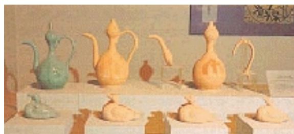
Figure 3. An exhibition at the National Folk Museum shows the process of making celadon