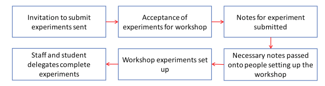
Figure 2: The process undertaken to set up the ASELL workshop held at the University of Adelaide

The workshop was organized following the procedure shown in Figure 2